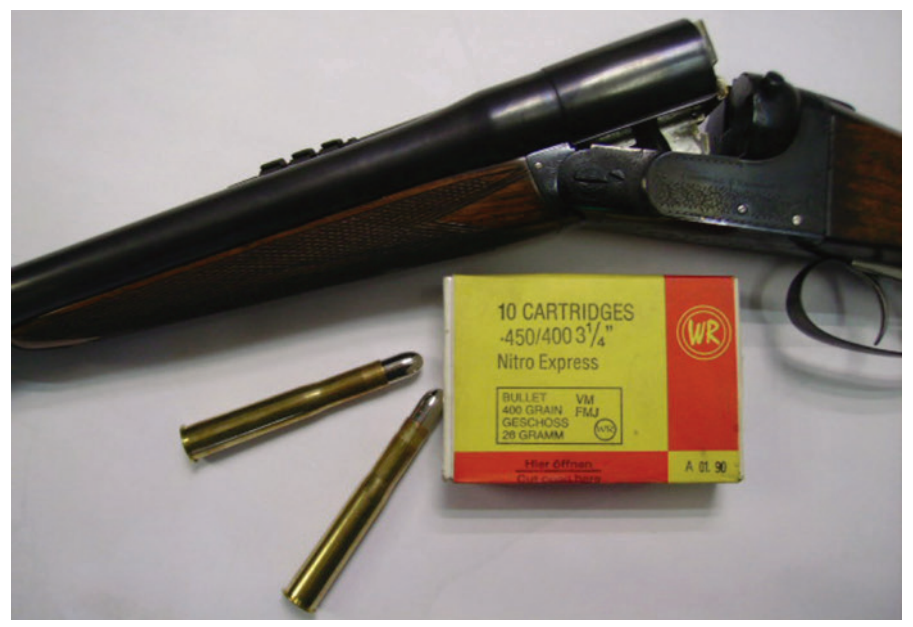
Da Silva was glad that the seller of the 13-lb English double rifle also had the ammunition to go with it: 450/400 3^{1}/4^{"} .