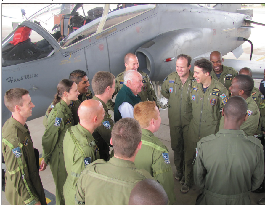
At Makhado Air Force base, Gen. Yeager passing on a joke to our South Africa Hawk squadron Pilots

So, goodbye my dear friend, until we meet again high in those blue skies you know so very well.